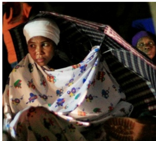
Young woman in Port-au-Prince

Furthermore, three medical experts from the US associations, one water technician from the French association and further medical staff from the Malteser International Rapid Deployment Unit RDU are on stand-by in order to support the international Malteser team on the ground. Malteser International is extremely grateful for this support and preparedness. However, for the time being no additional staff will be sent unless the real need on the spot is known. Nevertheless, based on the further development and the assessment results that we expect for next week, it cannot be excluded that Malteser International might need additional volunteer staff, especially in the medical field, to support the team in Haiti. We shall keep you informed about all further developments.